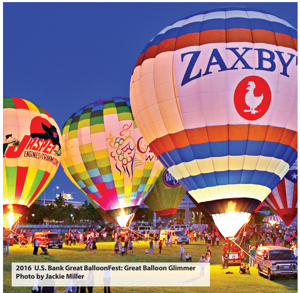
2016 U.S. Bank Great BalloonFest: Great Balloon Glimmer

We are excited to recognize both winners and all club members who are supporting them along the way. One of our goals as a club is to continue ballooning to the next generation and the support of our community's fantastic young people is a great way we are able to do this.