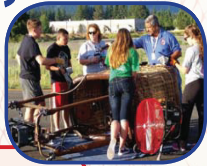
JULY 9-14 RIO GRANDE BALLOON CAMP, ALBUQUERQUE, NM