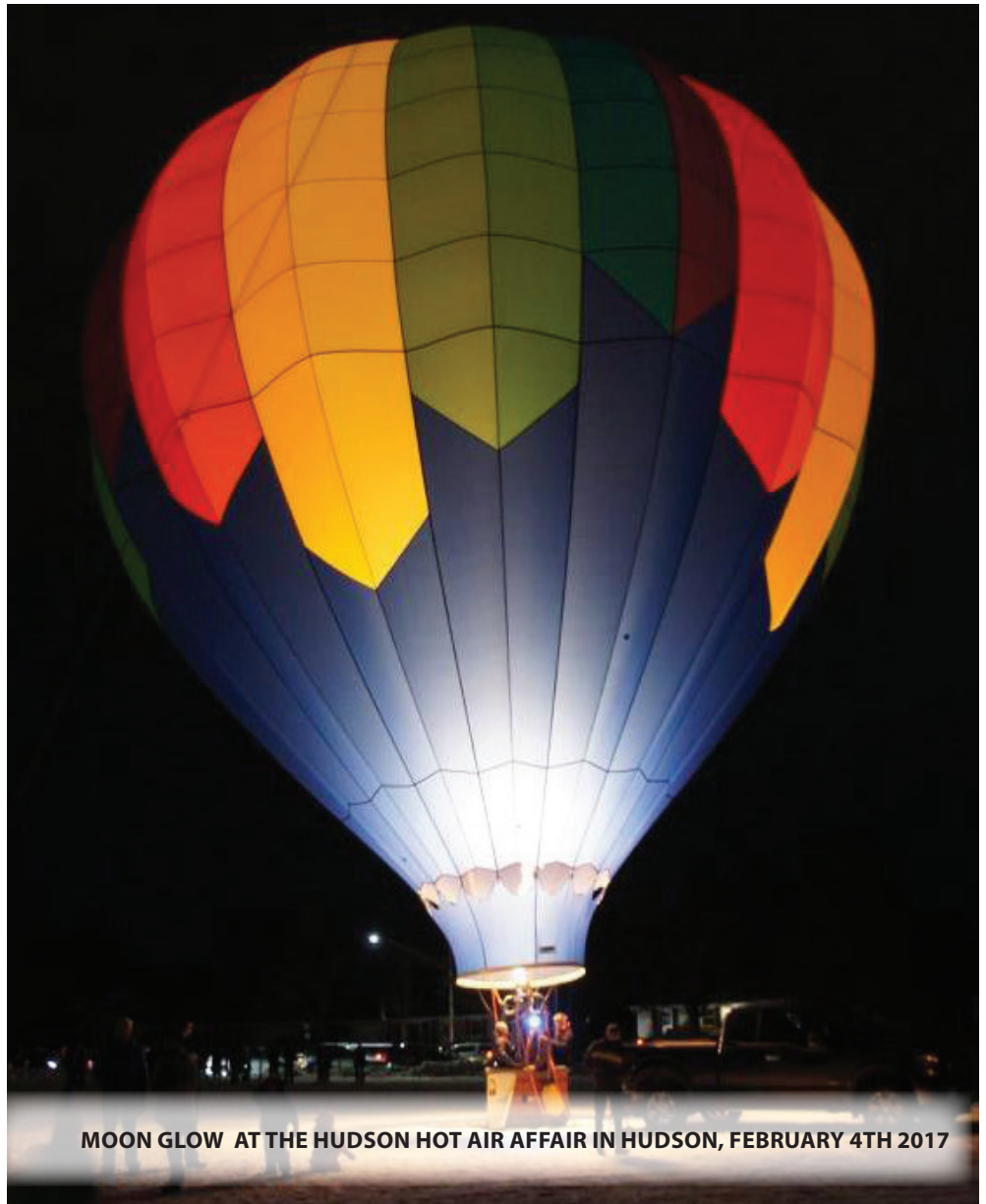
MOON GLOW AT THE HUDSON HOT AIR AFFAIR IN HUDSON, FEBRUARY 4TH 2017