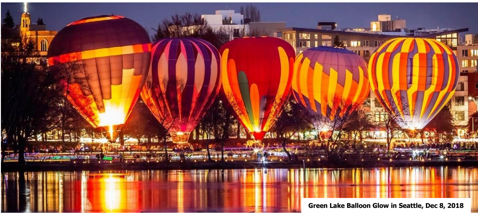
Green Lake Balloon Glow in Seattle, Dec 8, 2018