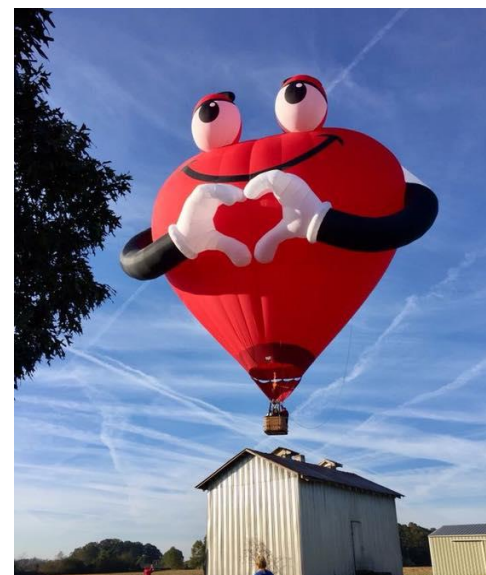
Te aMo in Statesville, NC 2017