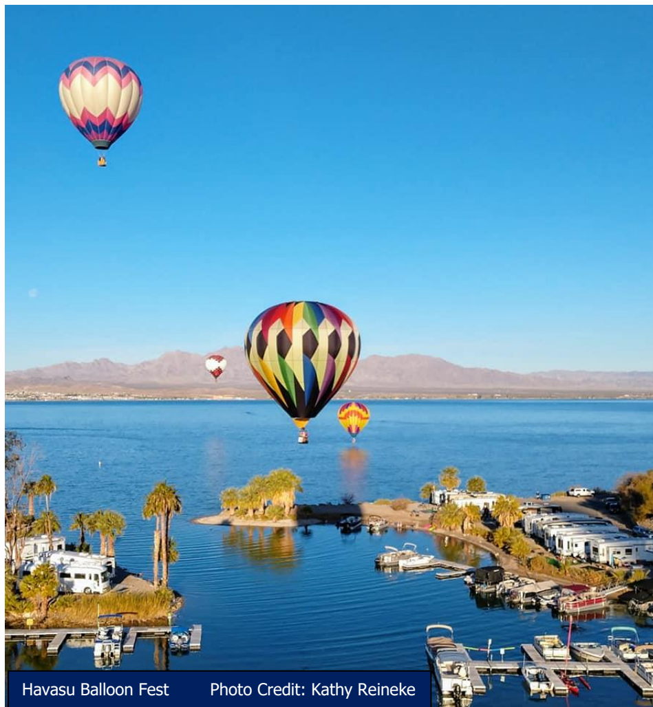
Havasu Balloon Fest

**If you are interested in your event being listed on the BFA Event page, please email: bfaoffice@bfa.net