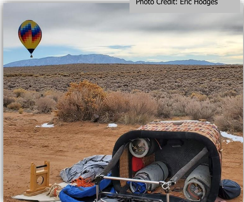
"Wild Child" Albuquerque, NM