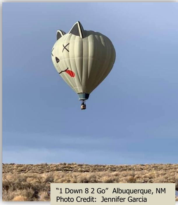
"1 Down 8 2 Go" Albuquerque, NM