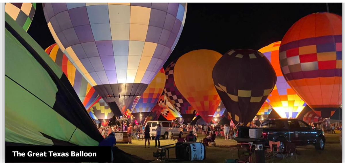
The Great Texas Balloon