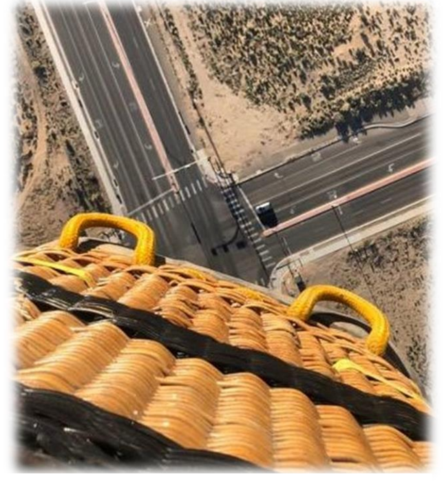
Morghan Chando, TOP GUN April 2019