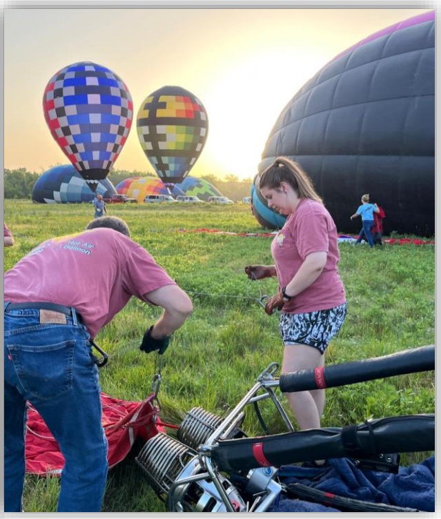
BFA Junior National Championship and GTBR Young Guns Competition