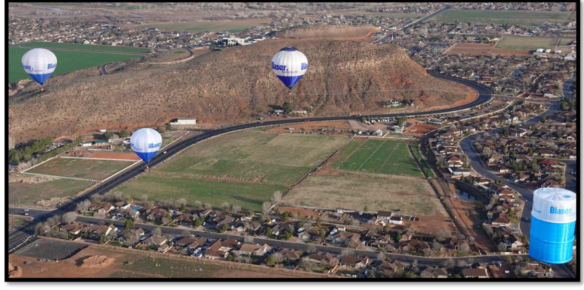
Blaser invited a large group of customers and wonderful pilots to fly the Blaser US fleet of five balloons in picturesque St. George, UT